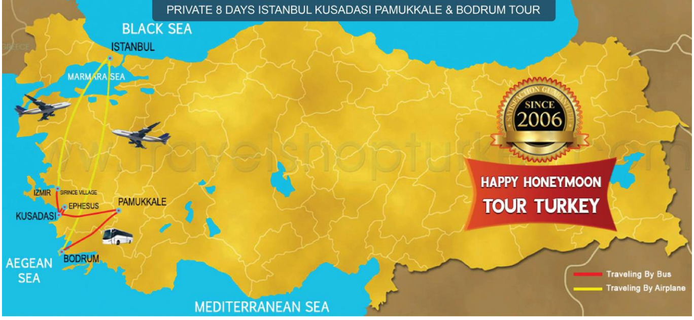
DAILY 8 DAYS ISTANBUL KUSADASI PAMUKKALE & BODRUM TOUR ITINERARY:

Welcome to Turkey! If you are looking for something special and extraordinary for a one week stay in Turkey, then look no further. The best tour in Turkey including Istanbul, Kusadasi, Ephesus, Pamukkale and Bodrum. This an exquisite tour for you with all the bells and whistles. There are no long bus rides just domestic flights getting you to your destination comfortably and relaxed. By booking this tour, you will be able to see Istanbul and Aegean Region.